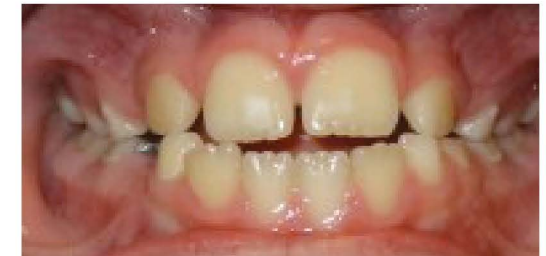
Patient Before the Program

Pre-treatment photographs are taken to document any changes to teeth over the course of the program.