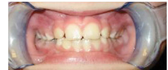
Patient After Four Weeks on the Program